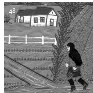
COVER: YVE LUDWIG